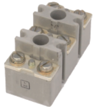
Type IC5885 three-point power terminal board