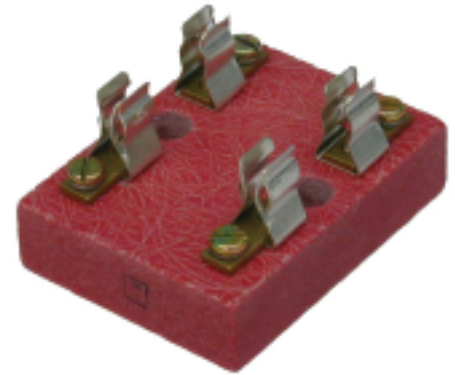
Type IC5898 Fuse Block