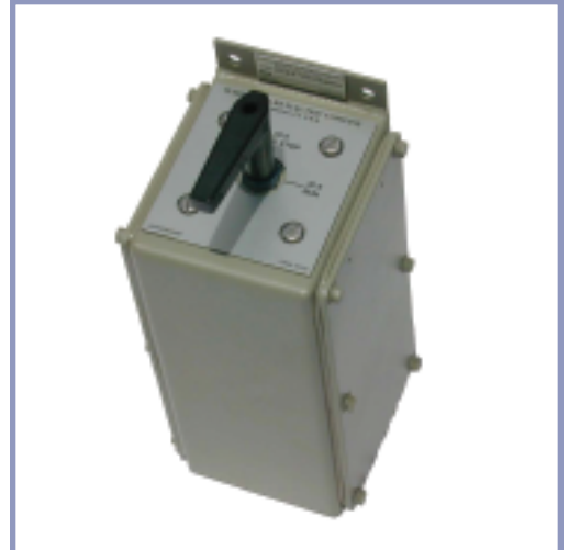
Type IC5847 Master Switch