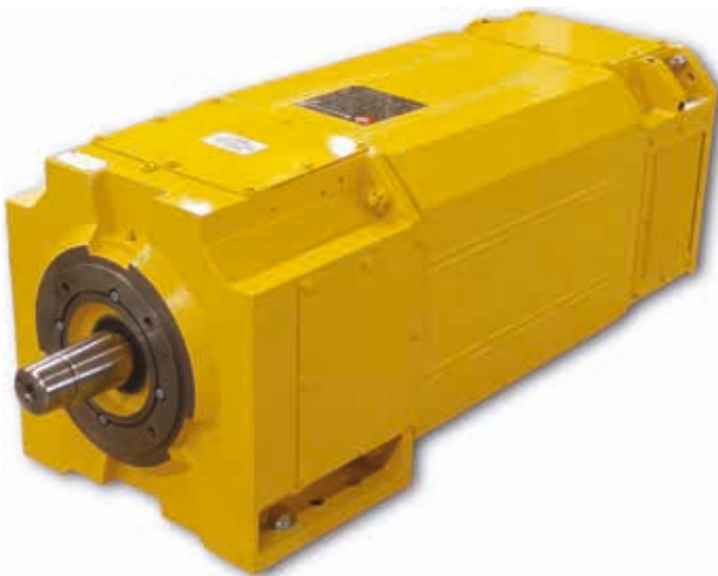
Figure 1. Punch the drill string harder with the WL12BB060 high power density drilling motor that provides up to 600 hp in a standard 400 hp 'square style' motor frame.

capabilities unmatched by existing technology. API standards place constraints on how strong certain load bearing and torque path components must be, which limits the design flexibility and material choices; therefore, wanting to remove metal from a structure that is intended to support hundreds of tonnes is a difficult proposition to consider. However, if other components of the apparatus could get lighter or take up less space without sacrificing performance, a distinct and quantifiable advantage would be achieved.